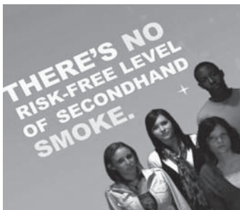
TV secondhand smoke advertising campaign.

The task of clearly explaining plan benefits goes on – only now it can be accomplished in more than just one language.