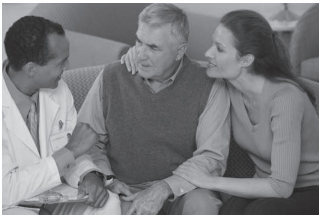
New Directions begins utilization management services for BCBSKS members on Jan. 1, 2009. The extensive BCBSKS contracting network will continue to be used for outpatient and inpatient services.