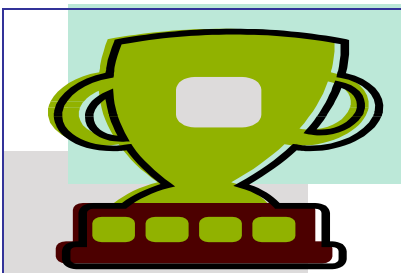
Blue Cross and Blue Shield of Kansas is recognized for their service to members enrolled in FEP in 2009.

“It is a great accomplishment to be recognized for achieving the Excellent Service Profile Award for 2009,”