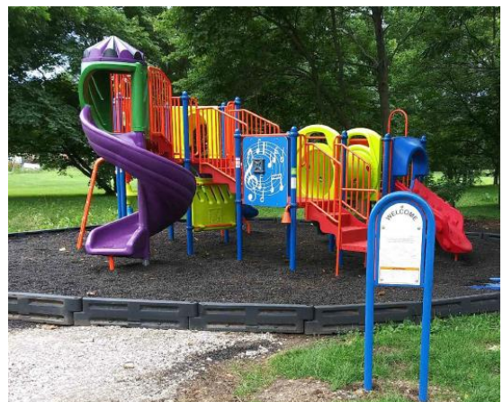
Figure 1. Playground at Pomona City park.

The spring 2020 survey had 202 respondents and the following key findings, which highlight progress that has been made and opportunities for additional work in our community.