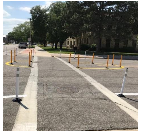
(Figure 2) 7<sup>th</sup> & Jefferson Bike Blvd. Demonstration Project

About 40% percent of respondents felt that there are insufficient sidewalks or bike paths in our community.