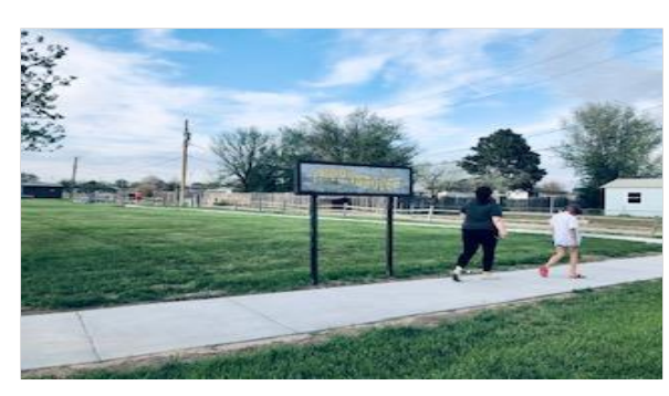
Figure 1. A new walking path around Thornbrough Park.

Finding #2: About 53% of survey respondents said they did not feel they were eating the recommended daily intake of fruits and vegetables.