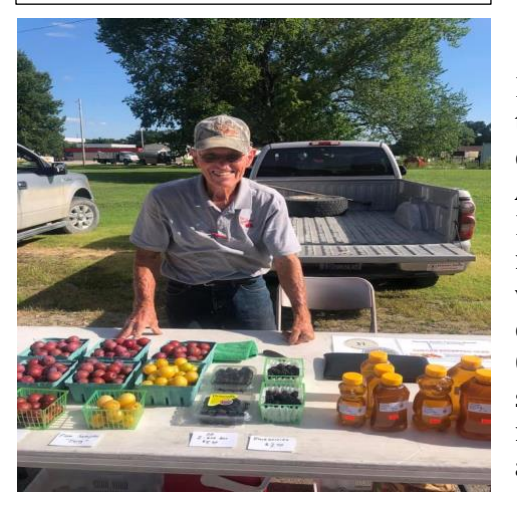
Figure 2 . Vendor at new Farmers Markets

Action being taken: We are leveraging the Safe Routes to Healthy Food Resolution to continue to push for additional sidewalks and bike lanes. Currently we are focusing the area in front of Tyson to complete safe access from south Emporia.