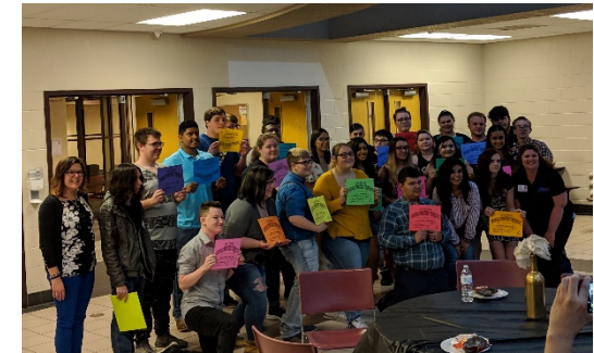
All Star Program Graduates from USD 403 Hoisington.

including tobacco use. Seven employers in the coalition area and the City of Claflin adopted written tobacco/vape-free policies, which evidenced by survey responses are drawing attention to the efforts to make a difference. Providers in the Clara Barton clinics continue to promote tobacco cessation with patients, making them aware of the assistance that is available to help ensure their success.