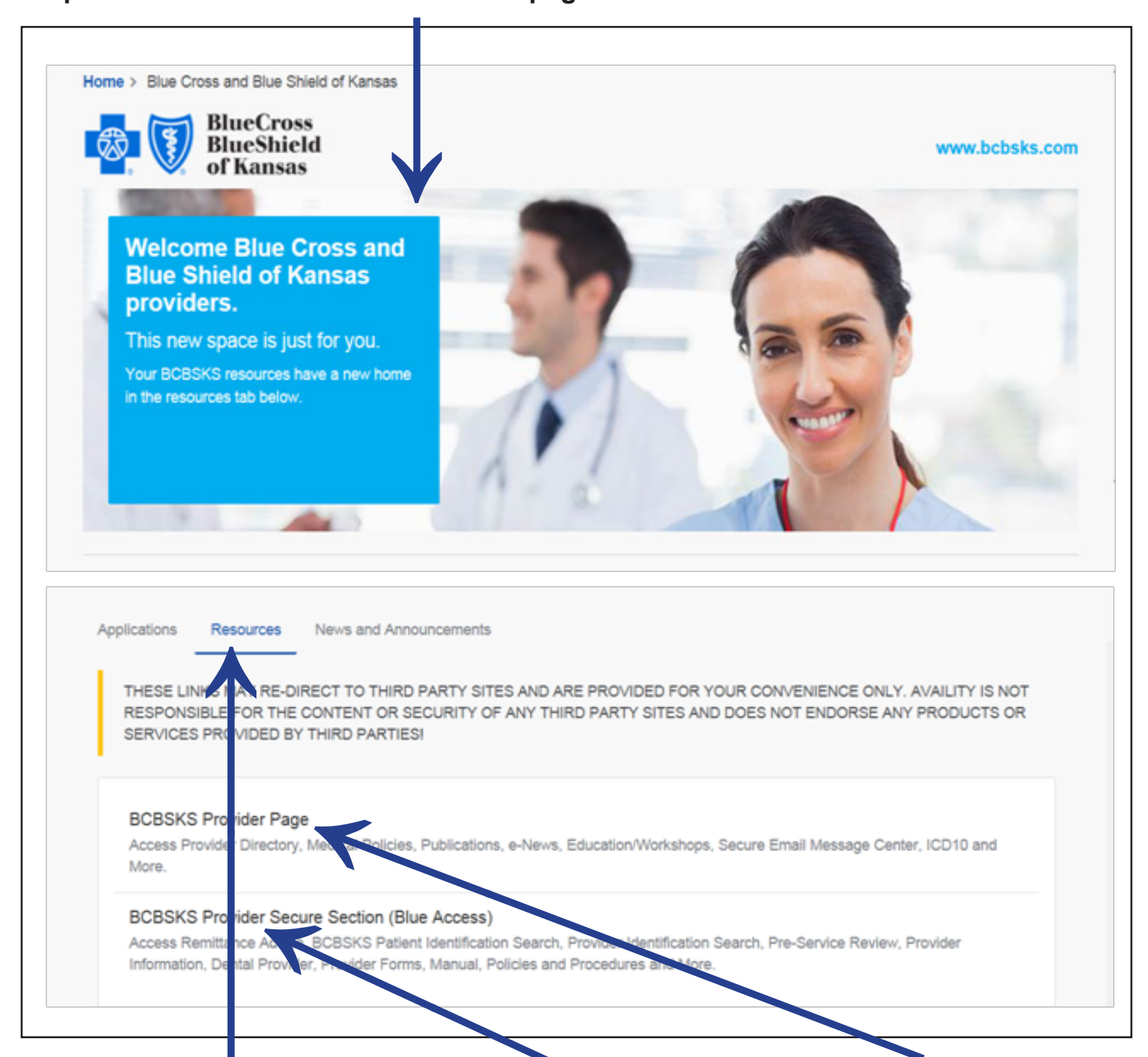
Step 4: Select the Resources tab